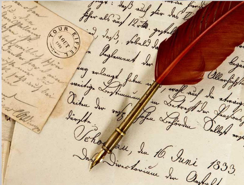
People wrote letters