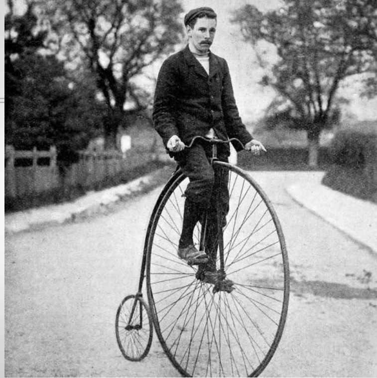
People rode these big bicycles